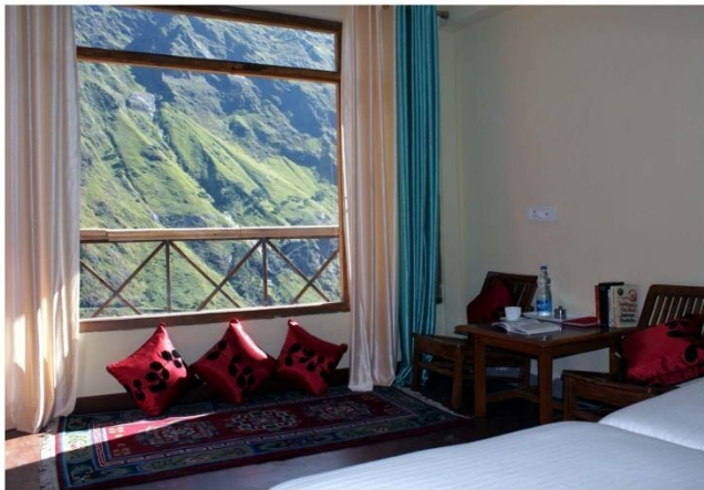
Himalayan Abode (Himalayan home stay)