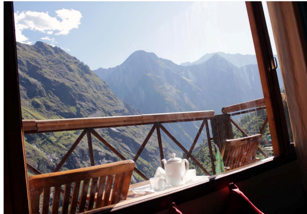
Himalayan Abode (Himalayan home stay)